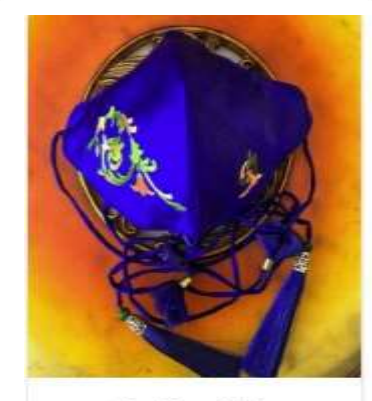
Royal Face Mask