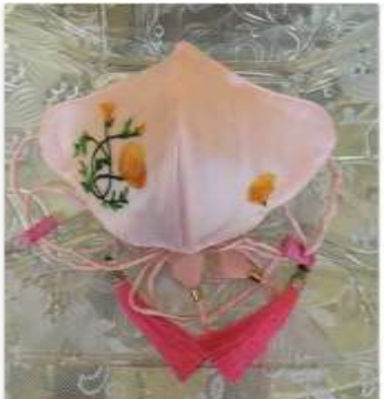
California Poppy Face Mask