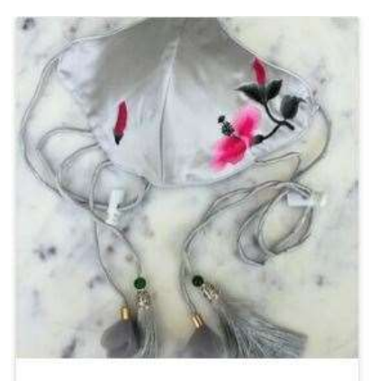
Hibiscus Face Mask