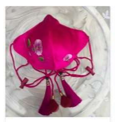
Morning Glory Face Mask