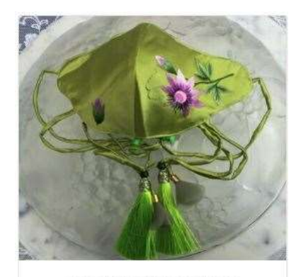
Good Heart Face Mask