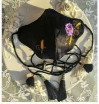
Magnolia Face Mask