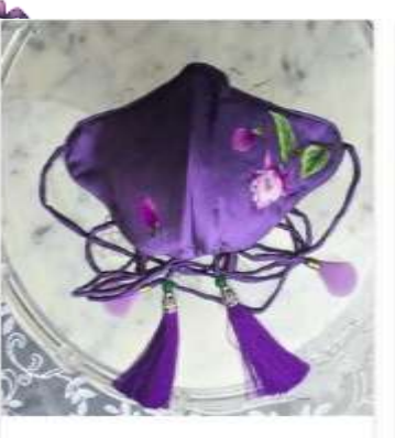
Fuchsia Face Mask